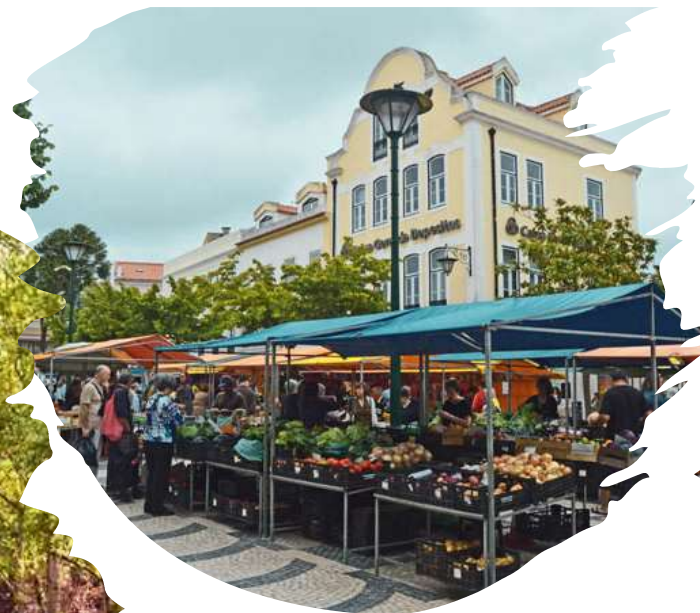
Caldas da Rainha