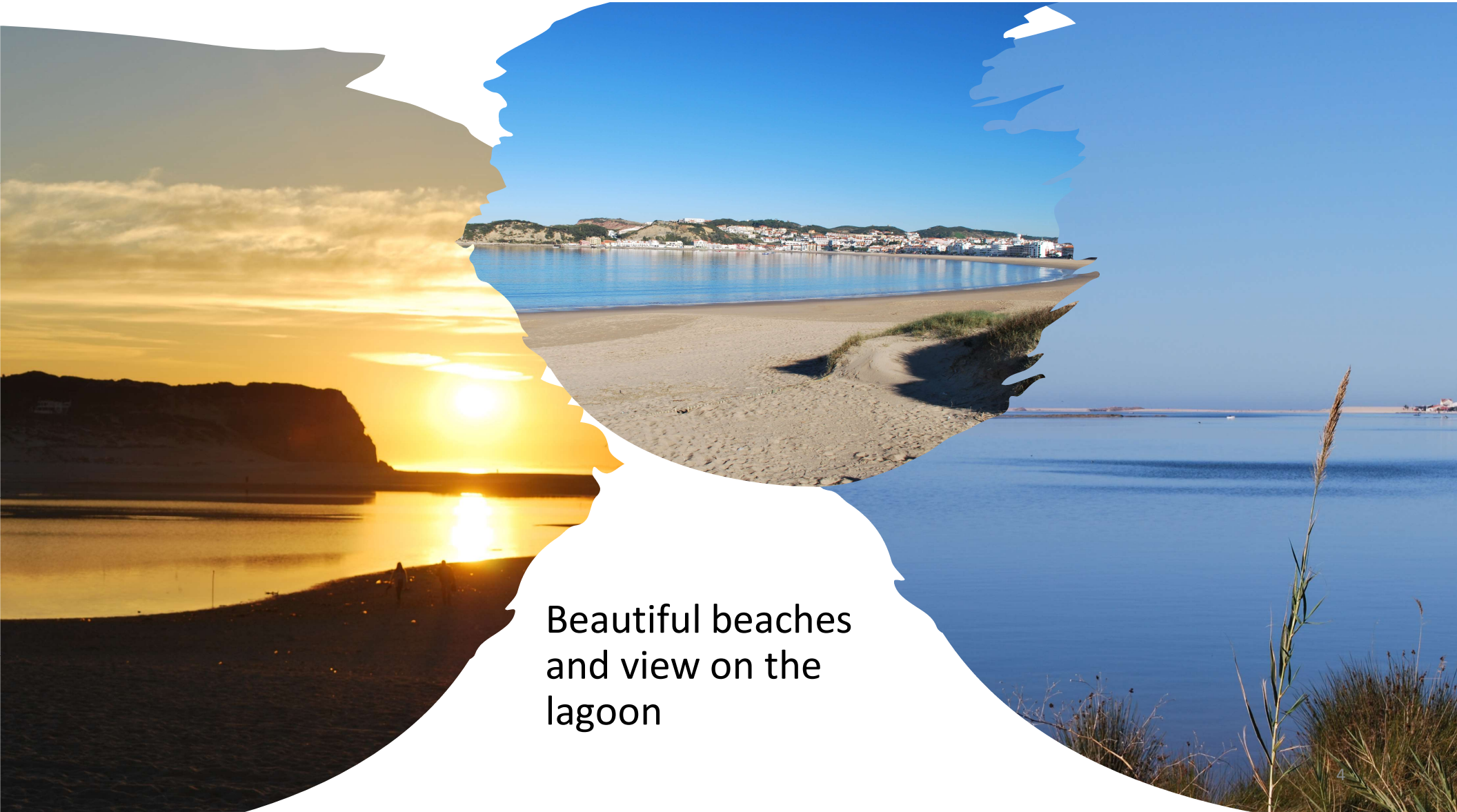
Beautiful beaches and view on the lagoon